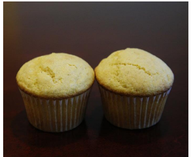
Two of Jiffy's famous corn muffins.