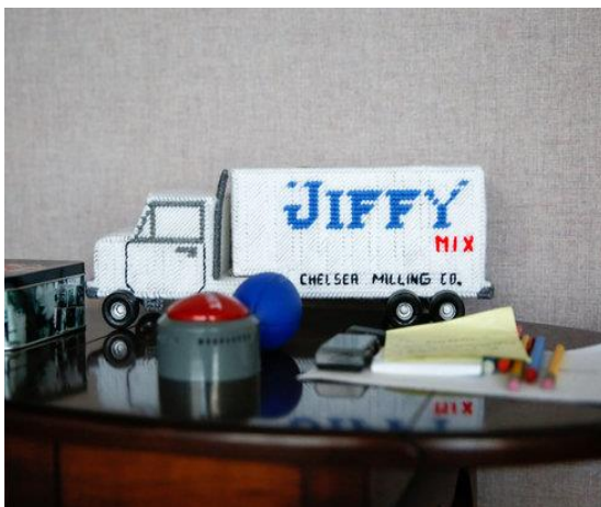
One of the many "Jiffy" themed toys, collectibles and trinkets that fill the offices of the Chelsea Milling Co.