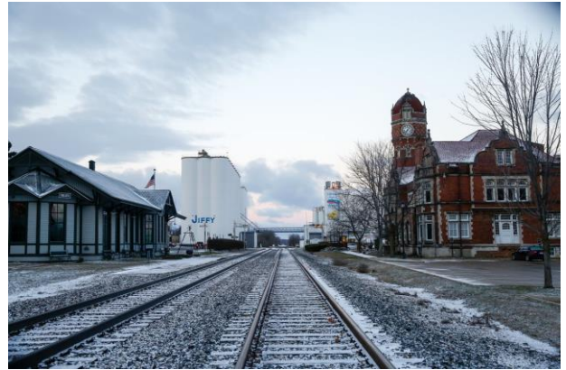
Chelsea Milling Co., best known for making its iconic Jiffy products, in downtown Chelsea, Mich.