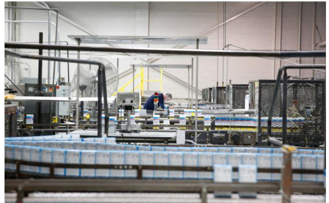
Scenes from the factory floor. (Top left) Filled and sealed boxes of corn muffin mix on a conveyor. (Top right) When boxes are filled with corn muffin mix, an extra little burst of golden mix shoots up into the air. (Bottom) A factory worker checks boxes after they've been filled with mix.